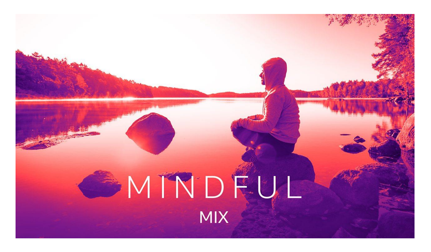
'Mindful Mix', a classical music playlist, part of the Covid-19 Collection

also showcased music tracks, from classical to soundtracks to classic BBC natural history programmes, all of which were chosen to promote wellbeing during lockdown.