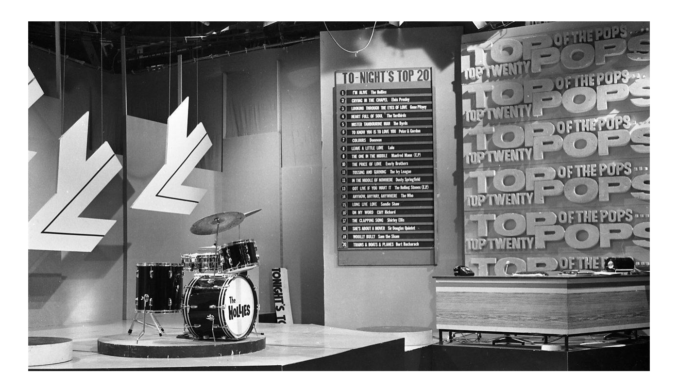
The Joy of Sets: historical set pictures of the BBC's photo archive made available to serve as conference call backgrounds.

In addition, the team offers a non-commercial service making BBC archive material available to the public and galleries, libraries, archives and museums for exhibitions, events and screenings. Whilst the number of physical events and screening necessarily went down due to the virus, the demands for content to be made available online saw a significant increase and a rethink of the approach to clearing rights for these uses. The team also supported the academic sector with research projects by providing limited viewing access to selected content needed to continue their work, due to the BFI and British Library not being accessible during lockdown.