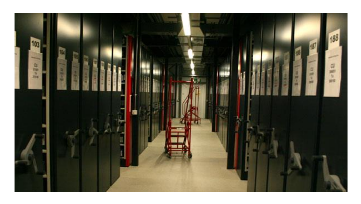
The BBC Archive vaults at Perivale, West London

This article looks at ways in which these teams responded to the challenges of the 2020 Covid-19 crisis with a series of positive initiatives centred on the use of archive content.