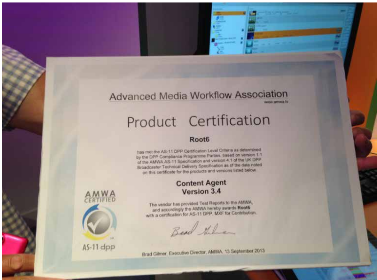
Exhibit 2: One of the companies to receive AMWA certification for the integration of the AS-11 standard within its Content Agent product was Root6 Technology.

So we can see that the world is currently in a state of evolution rather than revolution, and that changes are arriving step-by-step rather than with new technologies. There are some new approaches around, such as TICO, the newly proposed compression format from IntoPix. This is not yet standardised but was being launched at the show as a low delay 4k 60P encoding format. This could have an effect on archive requirements, since not only is it another format to handle, but the re-coding implications if content is transcoded for re-use are not known, and is a good example of an emerging technology that could have a secondary impact on archives.